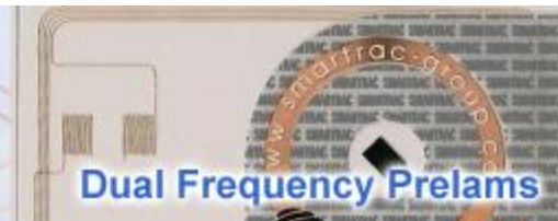
Dual Frequency Prelams